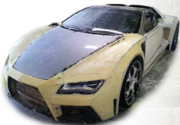
Hardtop & Roadster models are available, as well as an all-wheel drive option.