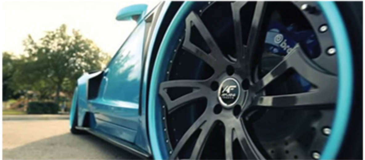
265/35/22 (front), 345/30/22 (rear) Pirelli Zero tires wrap the 22x9.5 (front) and 22x13 (rear) Amani Forged "Vaydor" custom rims.

To keep all that horsepower under control, the Vaydor's suspension setup utilizes a fully adjustable coil over kit with heavy duty sway bars and Big Brake Kits from Brembo, Wilwood, and Stop Tech. Active suspension or air ride set-ups are available add-on options.